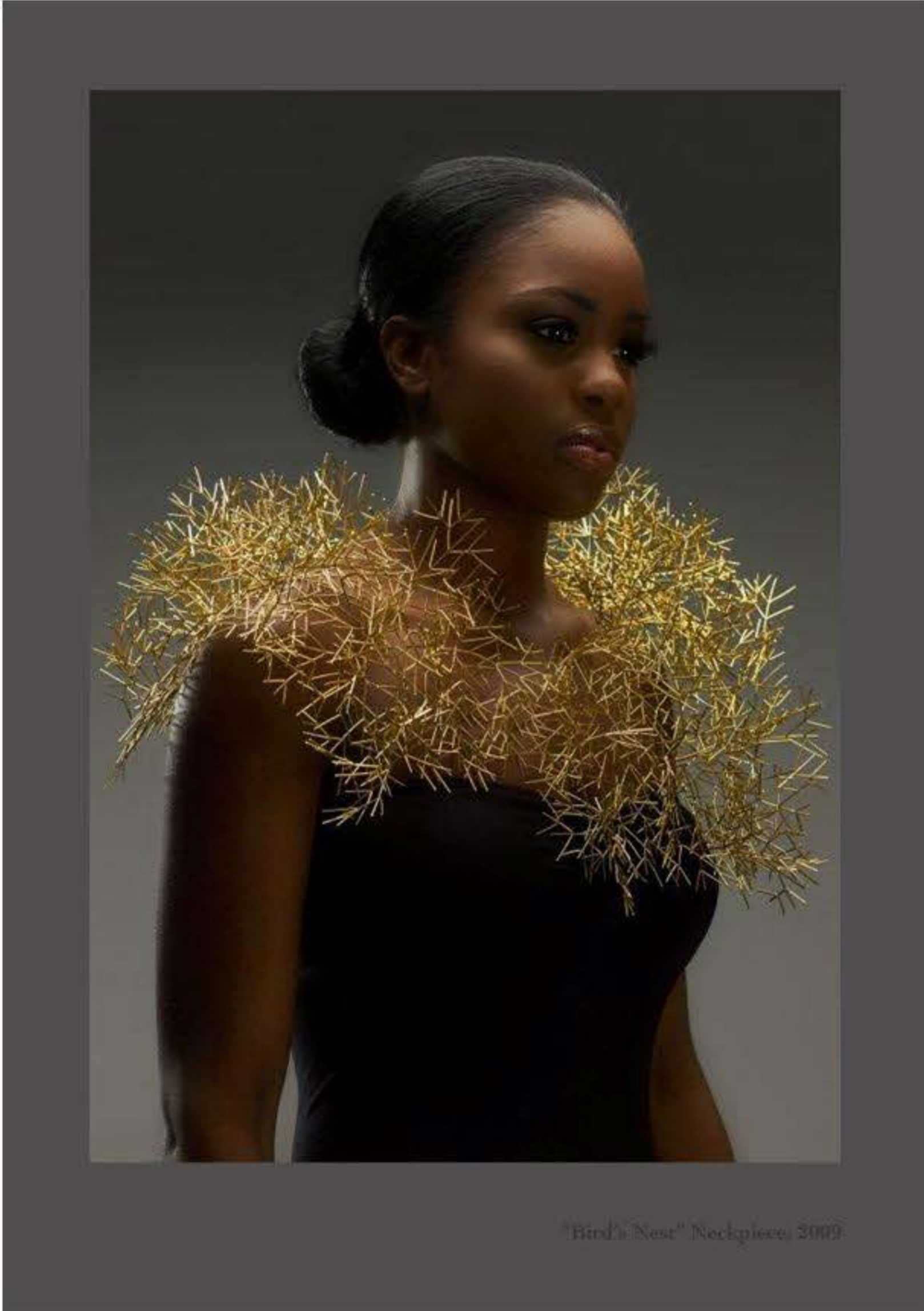
"Bird's Nest" Neckpiece, 2009