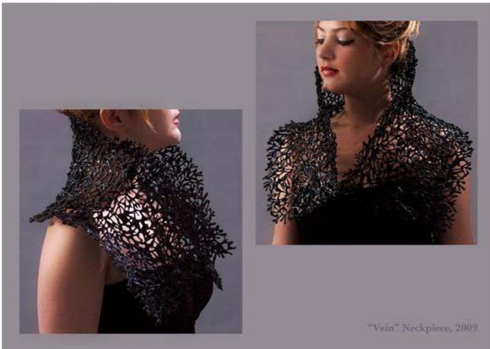
"Vein" Neckpiece, 2009