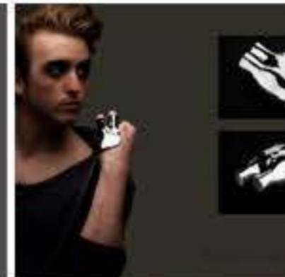
THE UN-DISCOVERED HAND- ME