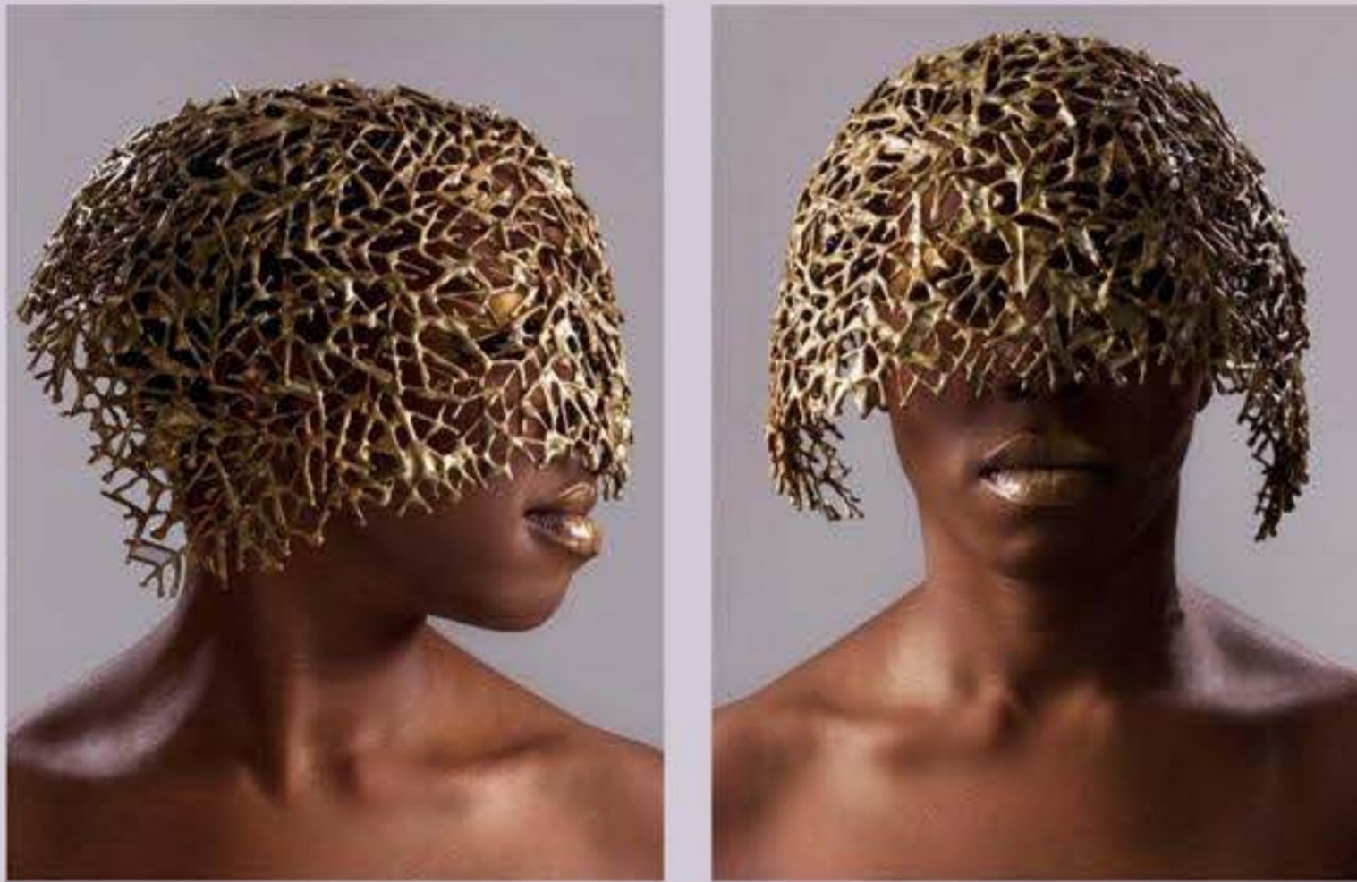
"Brain Cap", 2009