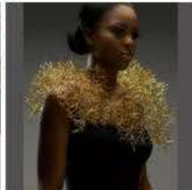
BIRD'S NEST NECKPIECE