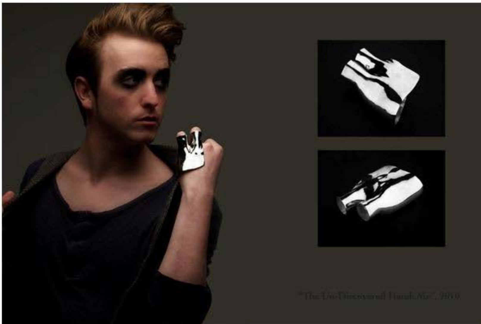
"The Un-Discovered Hand-Me", 2010